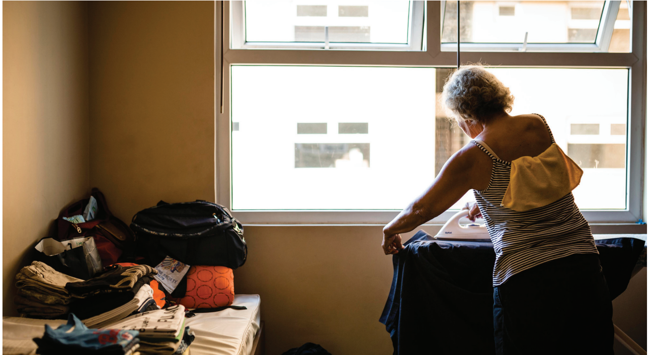
From childbirth to child-rearing and child-nurturing, women primarily perform the task of raising the country's future productive citizens and human resources. However, given that the time allocated to housework affects the time spent on market work, this raises several critical issues based on economic and sociological perspectives.

One possible element is the complementarity of husband and wife's time devoted to housework. An increase in the price of a good increases the demand for the other good. Due to this effect, an increase in wage makes housework costlier for the male respondent. Because marital gains can be derived from complementarities, the wife decreases her time allocated to nonmarket work as well.