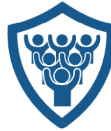
Promoting peace and security (including fostering unity amidst cultural diversity)