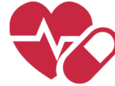
.... Unexpected medical expenses