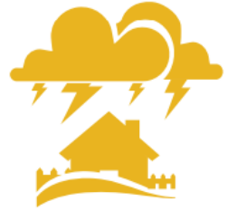
.... Expenses due to natural disasters