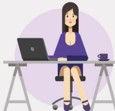
Women, SMEs and Inclusive Growth