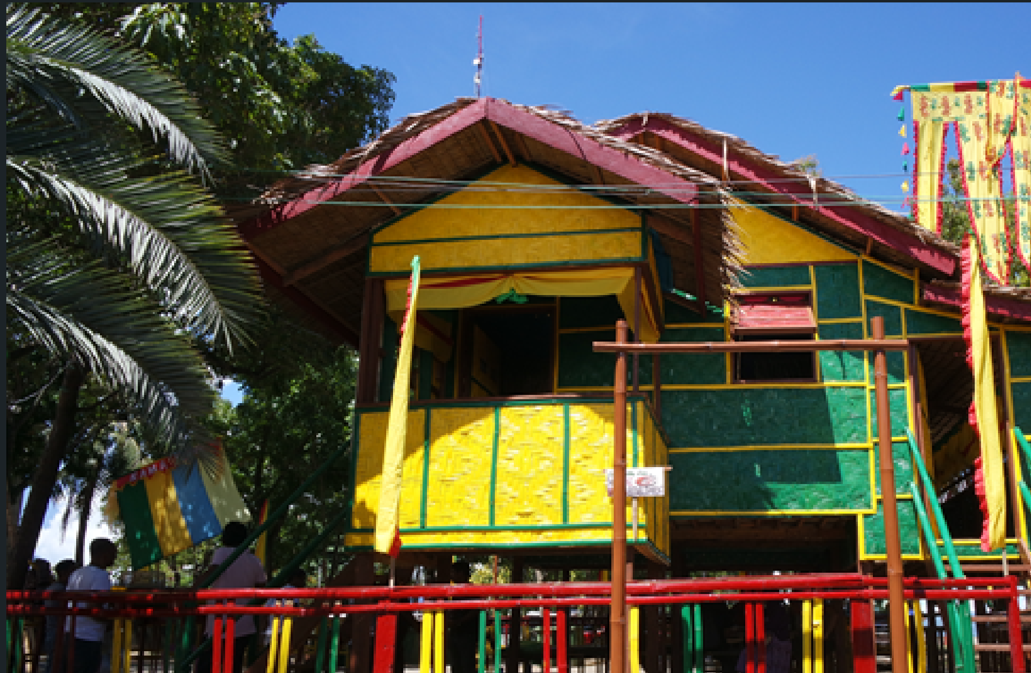
SAMA LUMA HOUSE