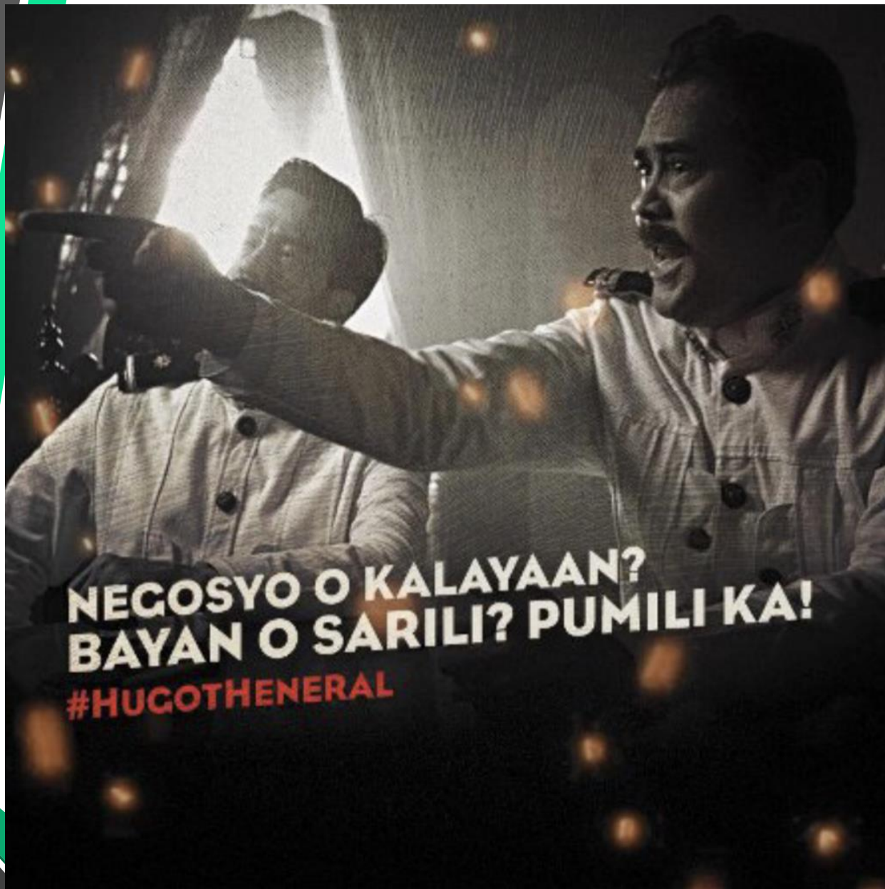
Image from Heneral Luna's Facebook page