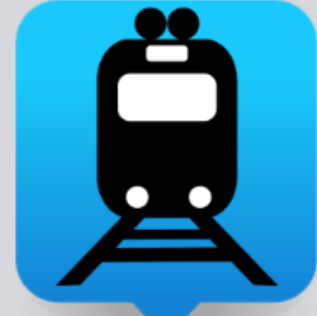
TRANSPORT, COMMUNICATION & STORAGE