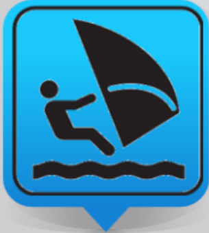
TOURISM, HOTELS & RESTAURANTS