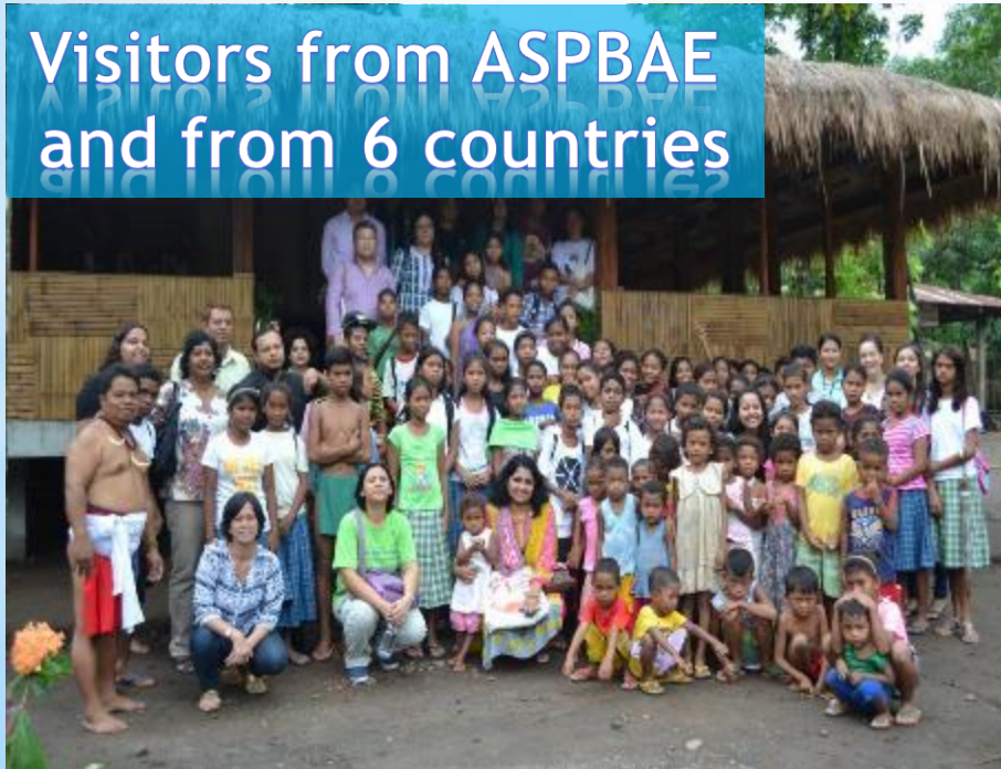
Visitors from ASPBAE and from 6 countries