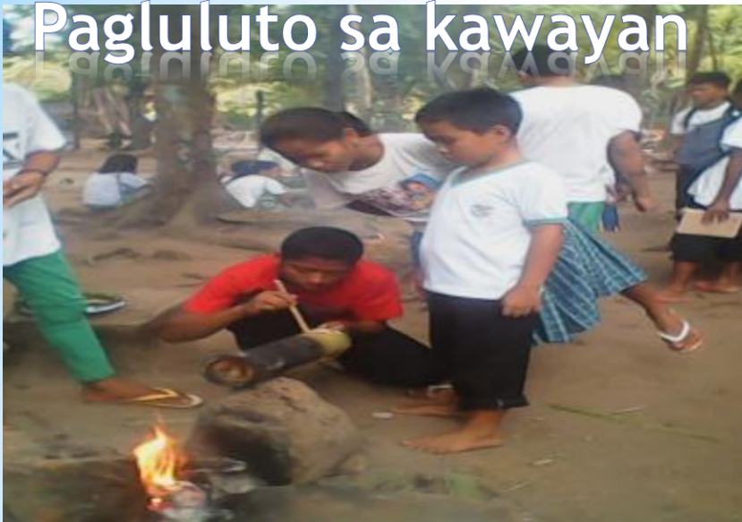
Pagluluto sa kawayan