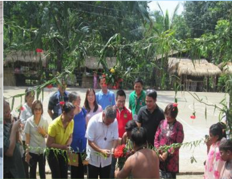
Blessing of Grade 9 room and MOA signing headed by DepEd Secretary Bro. Armin Luistro