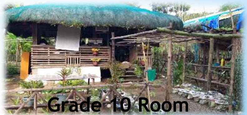
Grade 10 Room