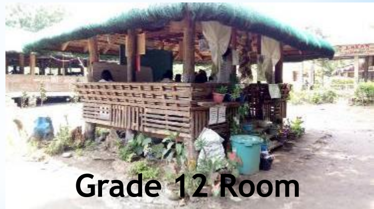
Grade 12 Room