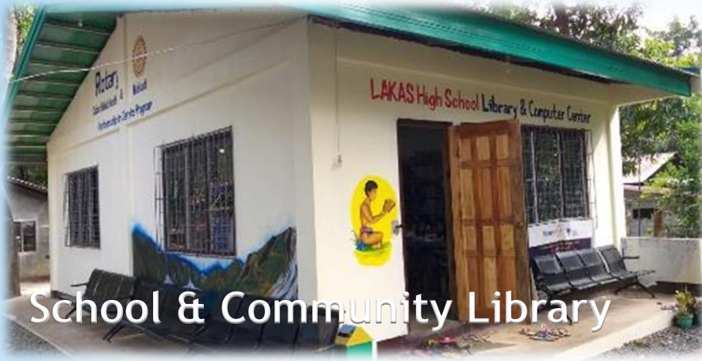
School & Community Library