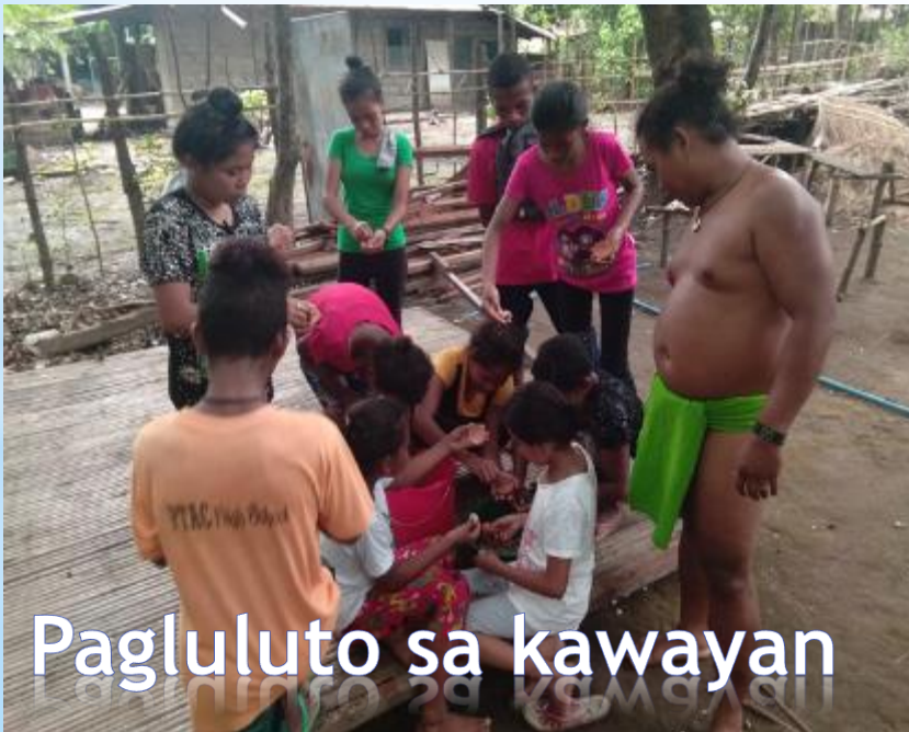
Pagluluto sa kawayan