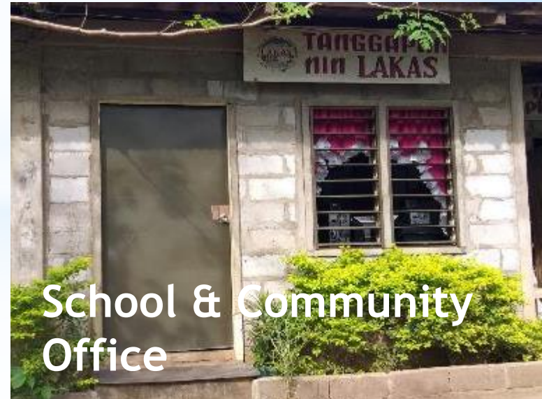
School & Community Office