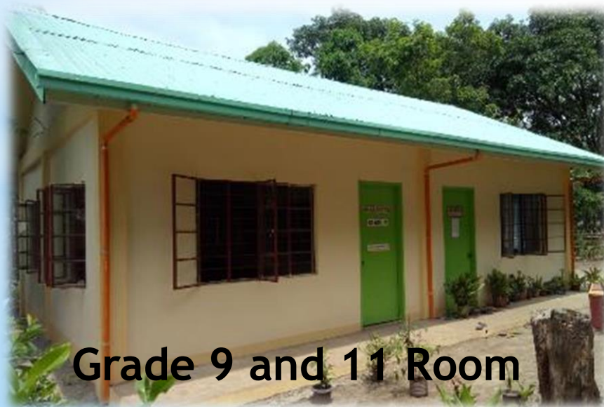
Grade 9 and 11 Room