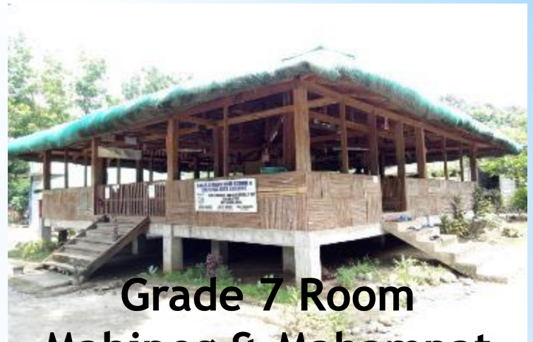
Grade 7 Room Mahipeg & Mahampat