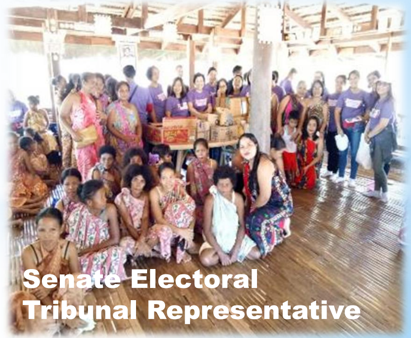
Senate Electoral Tribunal Representative