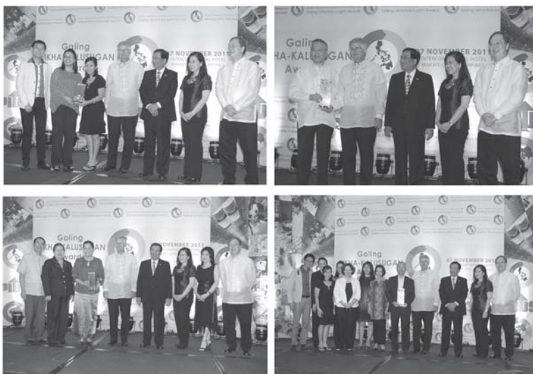
Winners of the First Galing Likha-Kalusugan Awards: Community Health Information Tracking System (top left), The Generics Pharmacy Franchising Corp. (top right), National Kidney Transplant Institute (bottom left), and the Tarlac Wireless Access for Health (bottom right).

4) The Generics Pharmacy Franchising Corp., in appreciation of its Franchise Net-