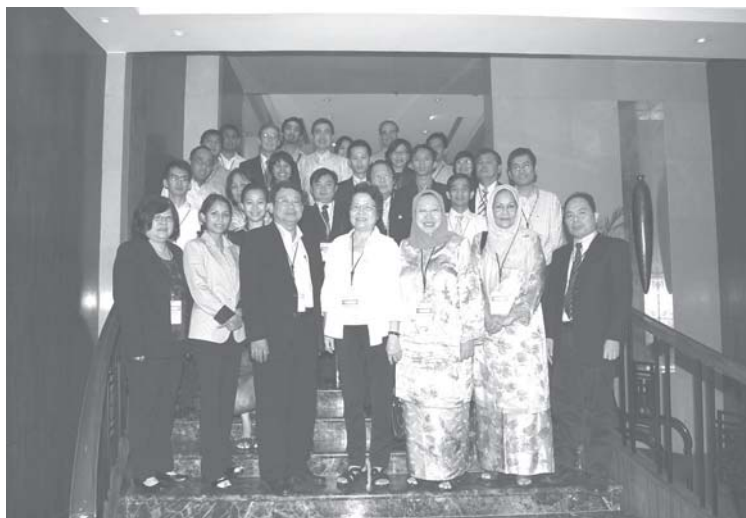
Researchers from Cambodia, Indonesia, Malaysia, Philippines, Singapore, and Thailand presented their crucial recommendations on how to improve policies on international labor migration in ASEAN in a Regional Policy Conference held recently in Manila, Philippines.

Moreover, in terms of financial gains, in particular remittances, the impact is more felt in the districts than at the national level. Data show that in 2006, remittances at the national level only contributed to 1.6 percent of the gross domestic product (GDP) while in Blitar and Ponogoro, the ratio of remittances to the gross regional domestic product (GRDP) reached 4.4 and 6.3 percent, respectively. At the same time, social problems brought about by separation resulting from migration like juvenile de-