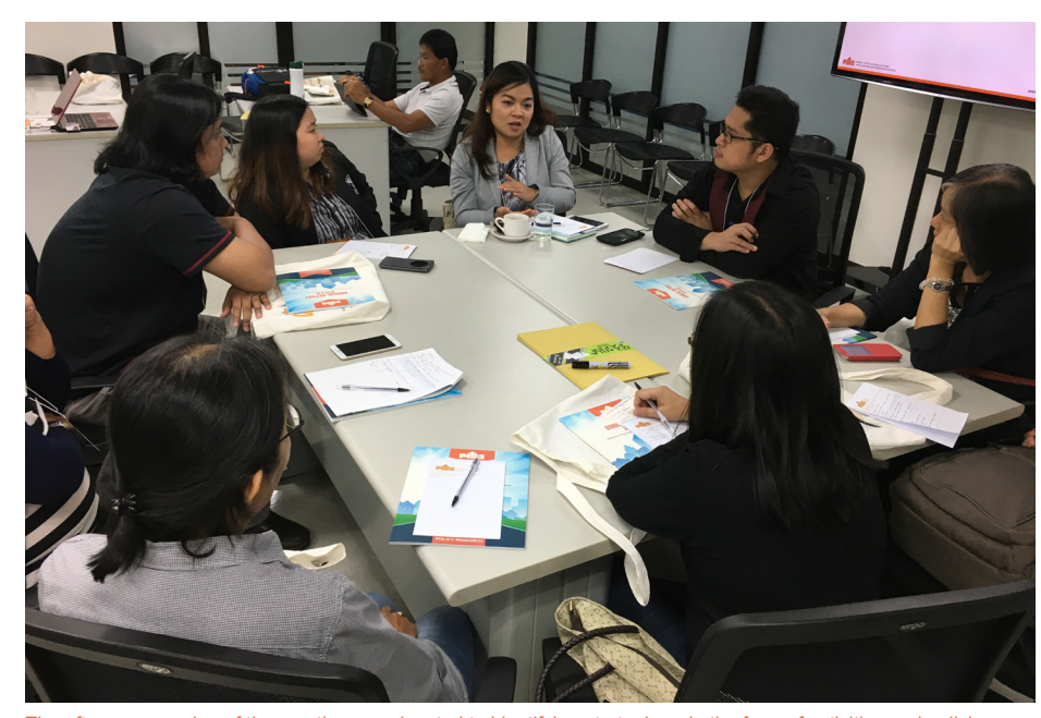
The afternoon session of the meeting was devoted to identifying strategies—in the form of activities and policies—that will help achieve the goals of SERP-P.

To achieve these goals, the participants drew specific recommendations that include, among others: pursuing formalization of partnership through a memorandum of understanding; incentivizing most active members through nonmonetary measures, such as providing certificates of recognition; increasing social media presence by liking and sharing SERP-P materials and events on Facebook; conducting more frequent meetings and promotional activities by visiting the locale of each member-