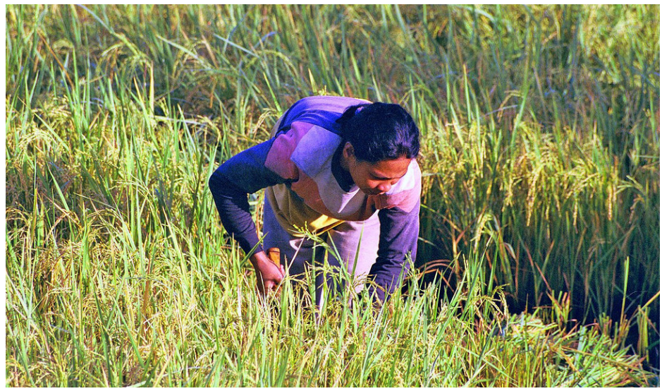
Western Visayas ranks third in terms of rice production volume and value. Photo shows a farmer working during harvest season in Capiz in Western Visayas.

Farmers are also more likely to avail of insurance after having experienced a life-altering environmental shock. According to the authors, farmers cope financially with climate-related disasters like typhoons and droughts by trimming their personal and household consumption. This ranges from shifting to cheaper food to letting their children