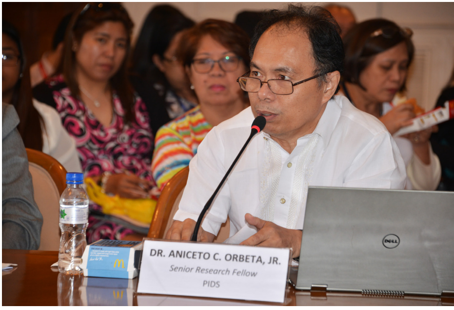
According to Orbeta: "With appropriate interventions, well-selected students with poor socioeconomic background are able to perform as good as their peers."

Lastly, Orbeta calls for the institution of a well-thought-out monitoring system so that critical features of the program can be rigorously assessed.