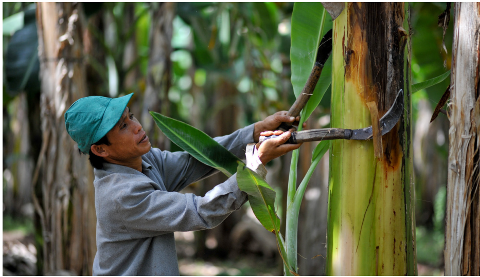
According to the Philippine Statistics Authority, a total of 3.2 million metric tons of bananas were exported in 2014, making it the most valuable agricultural export in the same year. Photo shows a farmer working in a banana plantation in Davao del Sur.