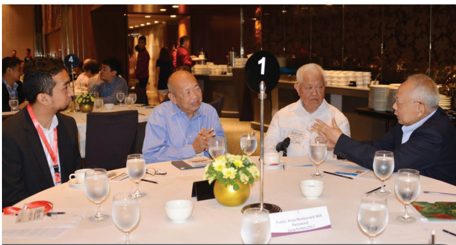
The APPC served as a useful venue for policymakers and public policy researchers to exchange views and participate in “intelligent” discussions on the federalism issue.

The conference covered key issues on federalism, such as its political feasibility in the Philippines, the form and fiscal design of a federal government, as well as the implications of federalism given the country’s political, economic, social, and historical contexts.