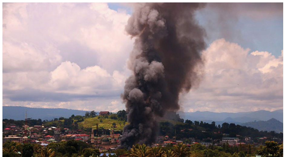
While the recent siege in Marawi has little effect on Mindanao's overall economy, the flow of goods and services to and from neighboring economies was hampered by the extremist events.

According to Arroyo, the ASCC was grounded on the idea that “Southeast Asia must be bonded together as a partnership of caring societies.”