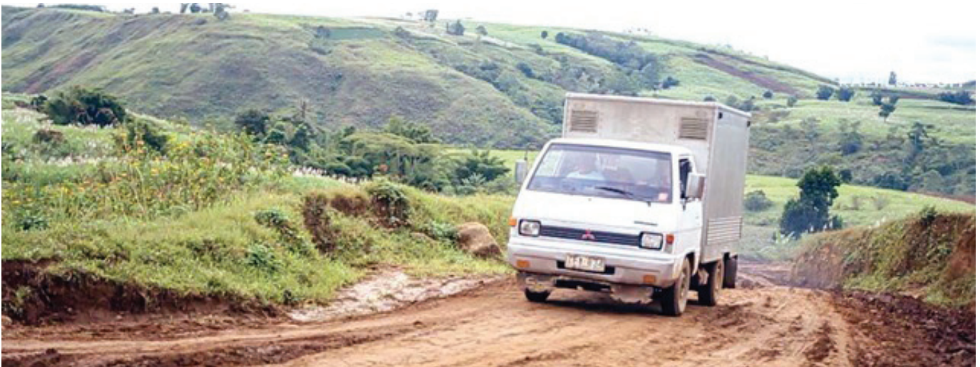
Under a federal form of government, regions with smaller populations may be at risk of underdevelopment due to low income generation.

Pascual also raised the need for the policymakers to define the brand of federalism that the country will adopt. He also encouraged them to consider other issues on federalism, such as its