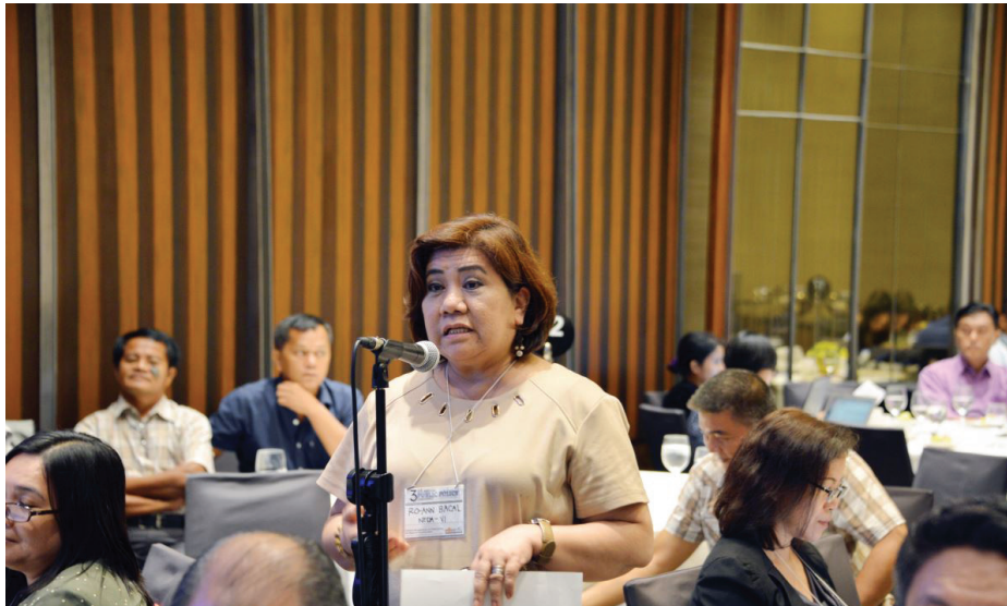
The majority of APPC participants (71%) were not convinced that shifting to federalism translates to sustainable growth and development, the event survey says.

impacts on business and investments, political structures, national identity, and languages.