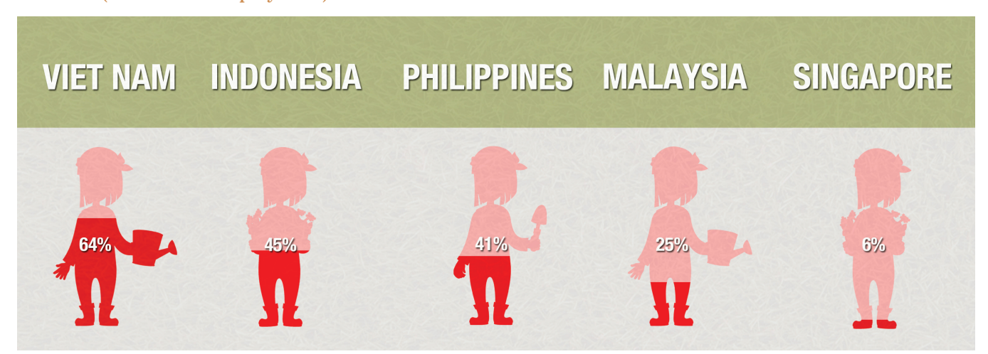
Figure 1. Female vulnerable employment in Association of Southeast Asian Nations in 2015 (% of female employment)