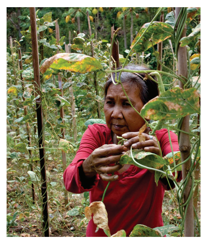
This study notes that women still tend to be involved in weeding and harvesting jobs, which are known to be less profitable than men's traditional jobs in agriculture, such as plowing. To address this, it urges the government to promote social enterprises in rural areas, which can create income-generating opportunities for women.

Adaptive social protection (ASP), a concept developed by the Institute of Development Studies, refers to the cohesion of social protection (SP), climate change adaptation (CCA), and disaster risk reduction. The linking of these concepts is relevant for various reasons. While SP aims to improve the accumulation of skills and human capital, it does not address vulnerabilities arising from climate change.