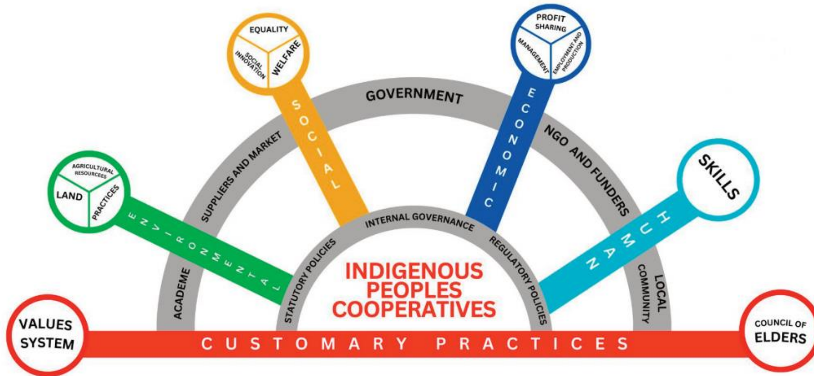
Figure 3: Sustainability framework for an Indigenous Peoples (IP) Cooperative based on the experiences of BUKTAMACO.

Note: This figure presents a sustainability framework for an IP cooperative, modelled after the experiences and practices of BUKTAMACO. Created by the researchers.